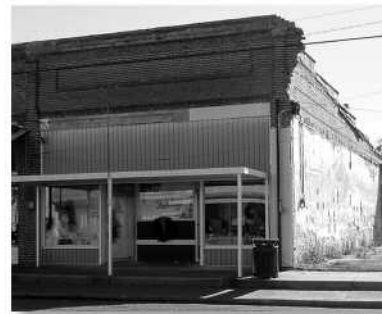
This 1920's structure, abandoned for more than a decade, will soon house a retail center.