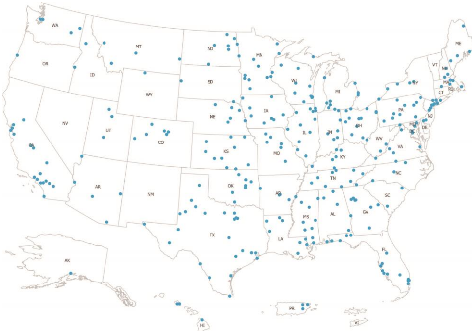
Exhibit 3: The 323 hospitals that we interviewed were located in 46 States, as well as the District of Columbia and Puerto Rico.